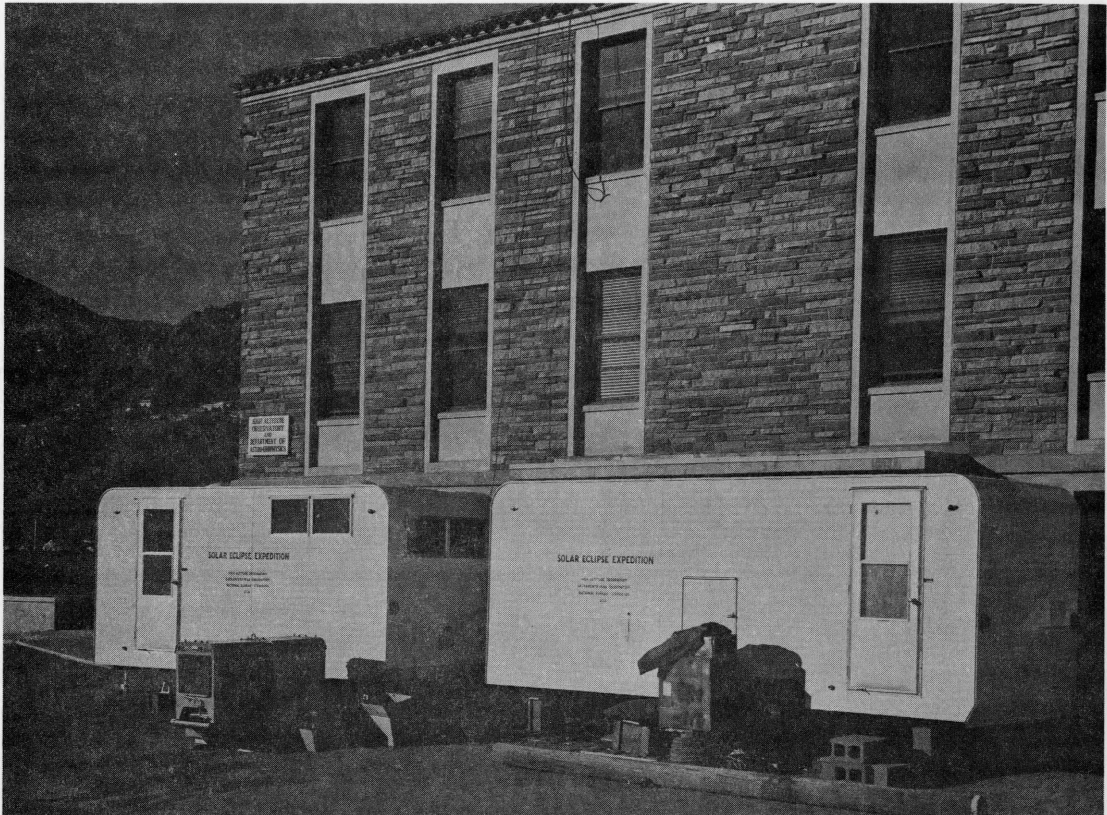
Solar Eclipse Expedition Equipment Trailers*

High Altitude Observatory of the University of Colorado Boulder and Climax, Colorado