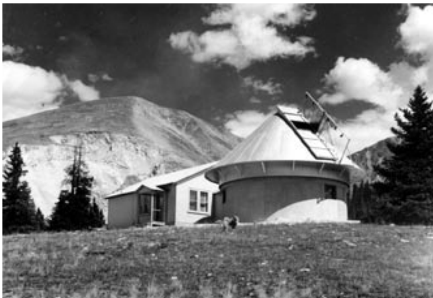
FIG. 5. A summer view of the Fremont Pass Station looking toward the northeast, c. 1946. Bartlett Mountain, which contained 95% of the known supply of the world's molybdenum reserves at this time, lies behind the house. The effects of the Climax Molybdenum Company's cave-in mining are apparent from the catastrophic subsidence on the southwest flank of the mountain. The unique conical-dome design was necessary to accommodate the 300' + of snow that fell on Fremont Pass each winter.

continued benefits to the HCO and his own personal program.