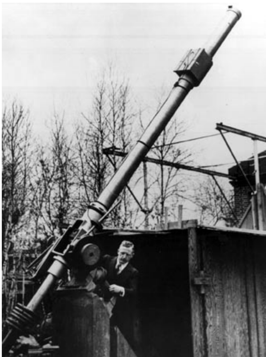
FIG. 6. Donald H. Menzel stands next to the coronagraph deployed for testing at the Oak Ridge Station of the Harvard College Observatory. This was the photograph that accompanied the Harvard press release of 28 April 1940.